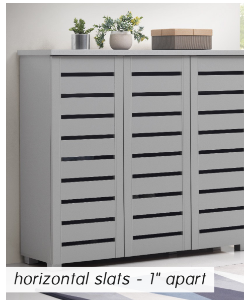
horizontal slats - 1" apart