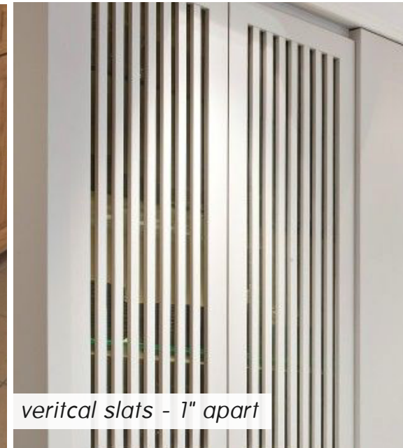
vertical slats - 1" apart