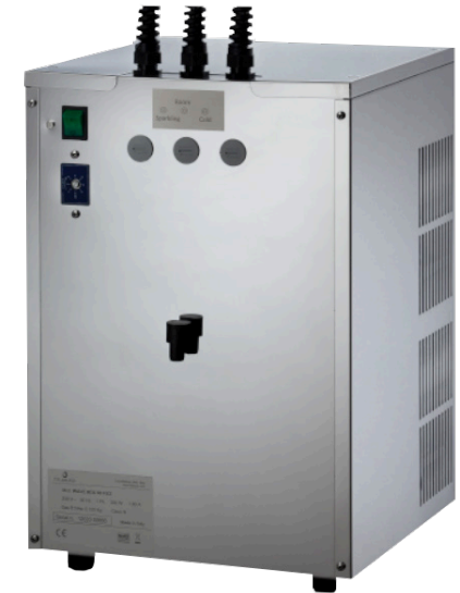
80 litres per hour C4 Perfect for commercial uses