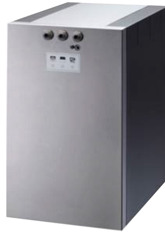
15 litres per hour C2 Perfect for a small family