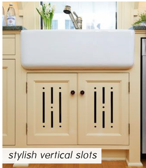
stylish vertical slats