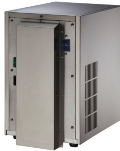
30 litres per hour C3 Perfect for a large family