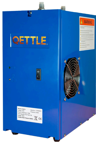
9 litres per hour C1 Perfect for a small family

Get chilled or sparkling, filtered drinking water straight from your tap! We have 4 options to suit your capacity needs.